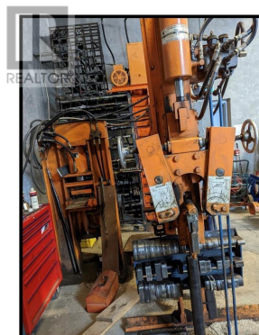
Small U-Bolt Bender