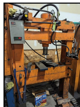
Large 150 Ton Press