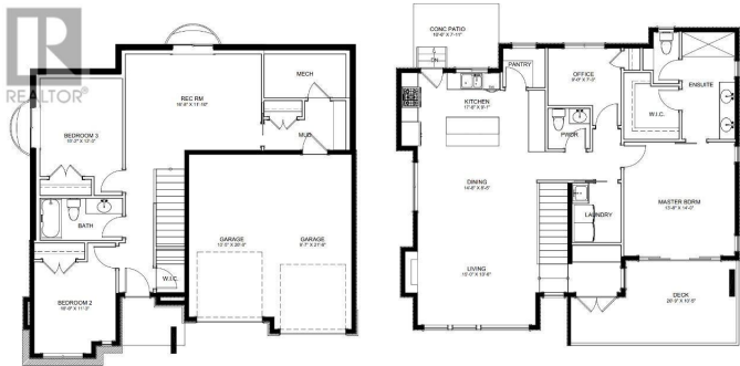
GROUND LEVEL: 853 SQ.FT. UPPER LEVEL: 1,209 SQ.FT. TOTAL: 2,062 SQ.FT.