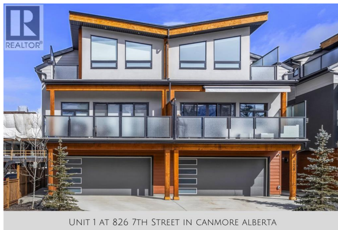
UNIT 1 AT 826 7TH STREET IN CANMORE ALBERTA

Welcome to this stunning like-new townhome, nestled in the heart of downtown Canmore, surrounded by the majestic Canadian Rocky Mountains. Offering the perfect blend of luxury and location, this exquisite home comes fully furnished, and boasts breathtaking mountain views from every room, creating a sense of serenity and connection with nature. Step inside to discover an open, airy layout with vaulted ceilings and a tall tongue-and-groove ceiling in the living room, amplifying the space's grandeur. The room is anchored by a massive stone fireplace, providing both a striking focal point and warmth, making it perfect for cozy nights spent admiring the snow-capped peaks outside. The chef-inspired kitchen is an absolute showstopper, featuring quartz waterfall countertops and a matching quartz backsplash, offering a modern aesthetic and durability. The sleek hardwood floors flow throughout the home, exuding timeless elegance, while the open wood staircase adds a touch of rustic charm. With four spacious bedrooms and four luxurious bathrooms, this home is designed for comfort and convenience. Three of the bedrooms feature their own ensuites, ensuring privacy and luxury for each resident or guest. Whether you're waking up to a mountain sunrise or unwinding with a sunset over the peaks, you'll enjoy views from every room. Step outside onto the south-facing deck—perfect for morning coffees, evening cocktails, or simply soaking in