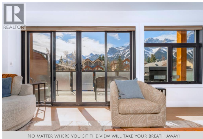
NO MATTER WHERE YOU SIT THE VIEW WILL TAKE YOUR BREATH AWAY!