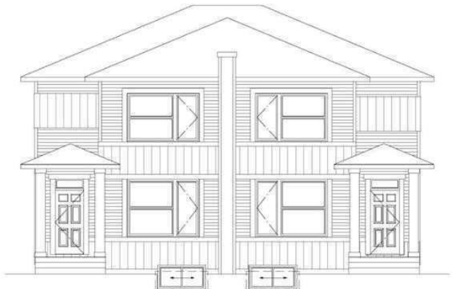
UNIT A UNIT B

Address 1937 Mccaskill Drive Subdivision N/A City Crossfield Province Alberta Postal Code T0M0S0